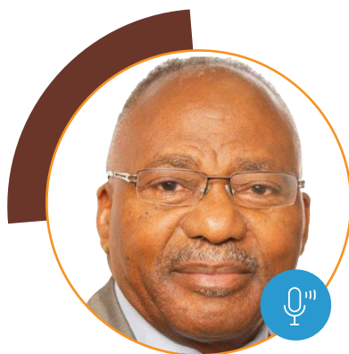
Prof Peter Hitjitevi Katjavivi

Professor Peter Hitjitevi Katjavivi is a Namibian politician who has been Speaker of the National Assembly of Namibia since 20 March 2015. He obtained a doctorate (DPhil) at St Antony's College of Oxford University.